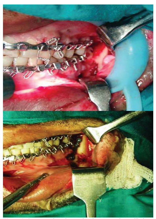
Figure-1: Intraoperative picture showing exposed mandibular angle fracture reduced and fixed with 2mm, 4 Hole with gap, Titanium Miniplate.

At baseline the mean pain score was 4.00\pm0.38 , with increase in time the pain scores continued to decrease. Statistically significant change in swelling was seen from 1 week