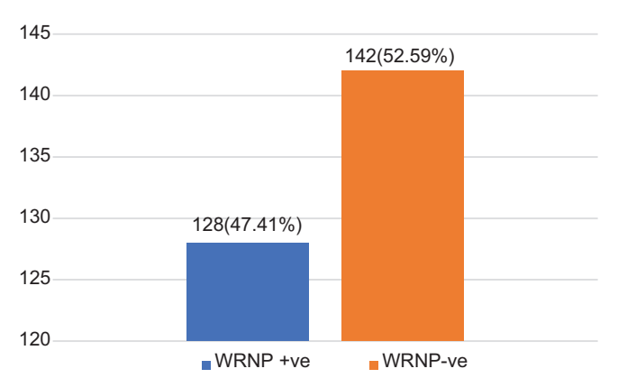
Figure-1: Distribution of the study population according to prevalenc of work related neck painn (N=270)

Association of WRNP with respect to selected factors were described in Table 4. Significant association were found between WRNP and individual factors (higher age, education below graduation), work related physical factors