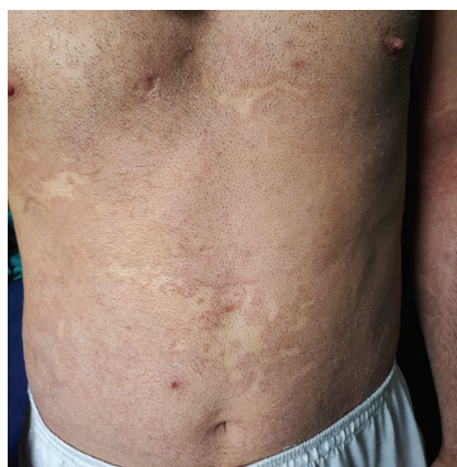
Figure-1: Extensive dermatophyte infection

these patients had completed the full course of systemic antifungals, 25 (33.8%) patients reported stopping treatment