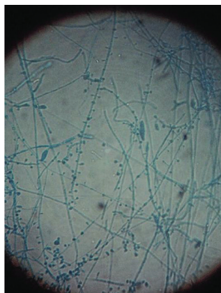
Figure-3: LPCB mount showing grape like microconidia and cigar shaped macroconidia with rat tail ends (T Mentagrophytes)