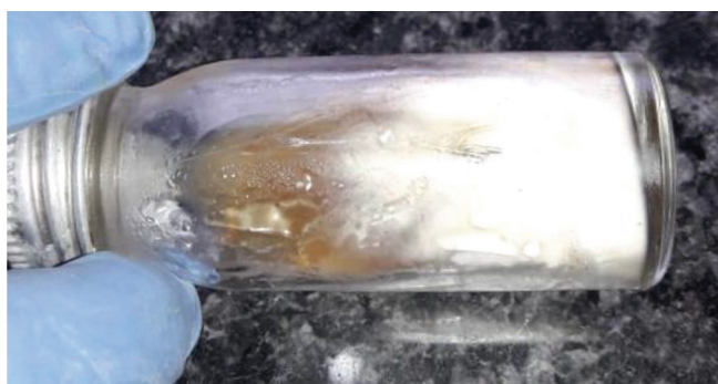
Figure-2: White powdery colony on SDA (T Mentagrophytes)