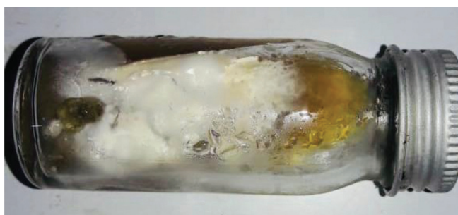
Figure-4: White powdery colony with radial rugae on SDA (T tonsurans)