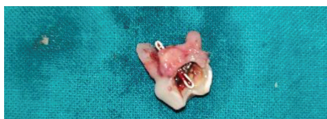
Figure-3: Extracted tooth w.r.t. 64 with lodged staple pin

1 Resident Pediatric Dentist, Department of Dentistry, District Hospital, Vadakkara, 2 Associate Professor, Department of Public Health Dentistry and Oral epidemiology, Sree Anjaneya Institute of Dental Sciences, Calicut, 3 Associate Professor, Department of oral medicine and radiology, Sree Anjaneya Institute of Dental Sciences, Calicut, 4 Senior Resident, Department of Dentistry, All India Institute of Medical Sciences, Mangalagiri