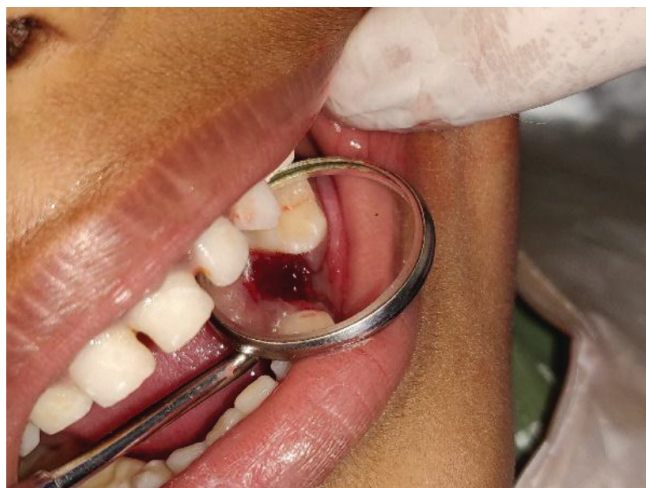
Figure-4: Post extraction socket

followed by placement of short band and loop w.r.t. 64.