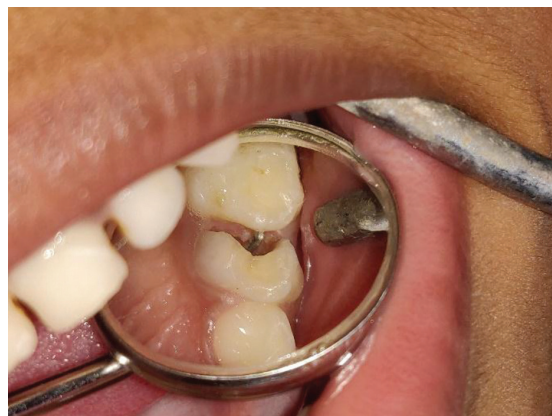
Figure-1: Intraoral Examination

A six year male patient reported to the department of pediatric and preventive dentistry with the chief complaint of pain on his upper left back tooth region since 1 week. The pain was spontaneous and aggravated on chewing. The patient reported of avoiding brushing in that area due to the severity of the pain. Medical history and Extraoral examinations were non-contributory. Intraoral examination revealed a deep carious lesion with a shiny silver object embedded w.r.t. 64 (Fig. 1). A detailed history revealed that the patient frequently used pencil nibs and stapler pins to remove food lodged within the tooth. Radiographic examination revealed a stapler pin lodged in the tooth which had penetrated the furcation and impinging the succedaneous erupting first premolar (Fig 2). The treatment plan involved emergency extraction of 64 (Fig 3 & 4) along with the foreign object under local anaesthesia