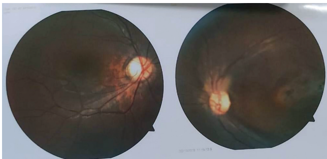
Figure-4: Fundus photograph

Fundus examination revealed no abnormality in right eye, however the media was hazy in the left eye. The fundus photograph (figure 4) revealed a macular scar in the left eye along with the evidence of old chorioretinitis in the same. There was no retinal breaks or retinal detachment seen bilaterally.