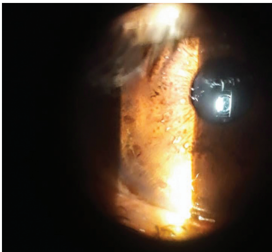
Figure-3: lisch nodules

Both eyes with Lisch nodules (Figure 3).