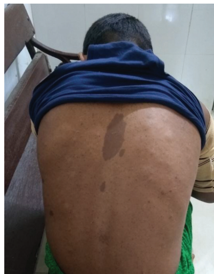
Figure-2: café-au-lait spots

Physical Examination revealed more than 20 different size café au lait spots [figure 2] throughout the body, sizes varying from 2mm to >7mm over the trunks and limbs especially on the face and back region; diffuse swelling of the right limb extending from the forearm till the finger tips causing disfigurement of the entire right forearm. There was evidence of freckles in the axillary and inguinal region with the presence of several soft cutaneous sessile neurofibromas varying from few mm to several cm in diameters were present along the trunk, limbs and neck region and especially on the face.