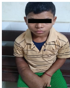
Figure-1: Patient presenting with largest neurofibroma lesion in his right hand

A 13-year-old male presented with a history of mass over the right limb since his childhood which was gradually increasing in size and causing disfigurement of right hand associated with blurring of vision in Left eye. On ophthalmological examination his Visual Acuity R/E - 6/12; L/E - 6/60. Telecanthus and broad nose were also noticed in this patient [figure 1]. Intraocular pressure was 16 mmHg and 18mmHg in the right and left eye, respectively.