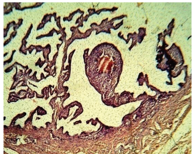
Figure-2 Photomicrograph showing secondary metastasis in the tubal folds (X4)