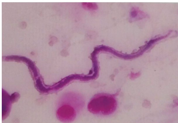
Figure-4: 32 year old male with a low grade fever for 1 month. Examination revealed a dullness on the right side of chest. Chest X-Ray showed a right sided pleural effusion. Diagnostic pleurocentesis showed a straw coloured fluid with a cell count of 3000 / cmm. Pleural fluid smears showing microfilariasis along with reactive mesothelial cells and a few lymphocytes (LG stain, 400x)

the ratio of 1:1. Treatment of microfilariasis was instituted after the cytological diagnosis. On FNAC, clear fluid was aspirated in 6 cases, blood mixed in 4 and purulent in one. Three cases of superficial lymph nodes (2 cervical and 1 axillary) accounted for 30% of the total diagnosed cases. Smears prepared from the aspiration of lymph nodes showed microfilariasis with a background comprising of reactive lymphoid cells. Previous workers reported similar findings in their studies. 5,6,7,12