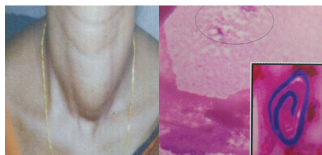
Figure-2: A 40 year old female with a slow painless enlargement of thyroid gland for 3 years.Examination revealed a 3cmx3cm soft to firm swelling in front of the neck which moved on deglutition.No cervical lymphnode enlargement was noted.Thyroid function test was within normal limits.Peripheral smear showed eosinophil count 9%Smears showed microfilaria (encircled)with benign follicular cells of thyroid in monolayered sheets(LG 100x), inset shows higher magnification of microfilaria.