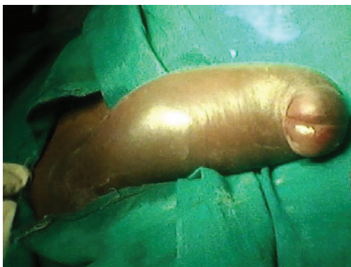
Figure-2: Preoperative view of penis (Dorsal surface)