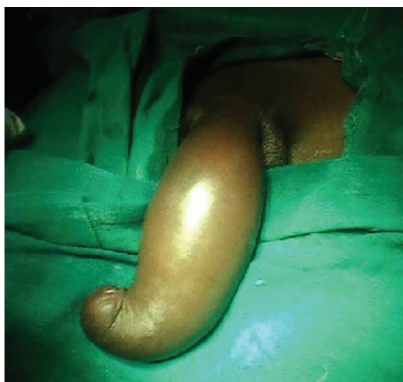
Figure-1: Preoperative view of penis (ventral surface)