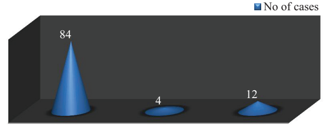
SICS with PCIOL Lens extraction Combined surgery with anterior vitrectomy