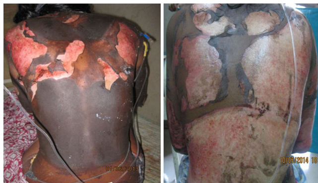
Figure-2: Clinical cases in study

medicine enabled H group patients who were more alert, cheerful, breath, eat, move and participate in their burn treatment more easily compared to Control group.