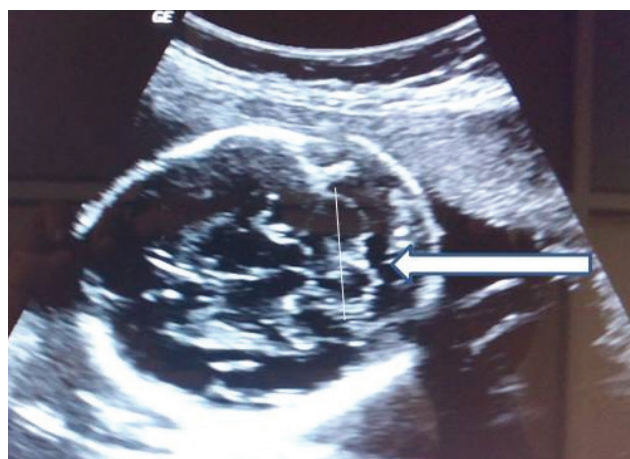
Figure-1: Ultrasonographic image showing TCD measurement (Arrow)

Of the 49 cerebellum of grade II, the median gestational age was 24 weeks and the median TCD was 27 mm. The minimum gestational age was 16 weeks, maximum gestational