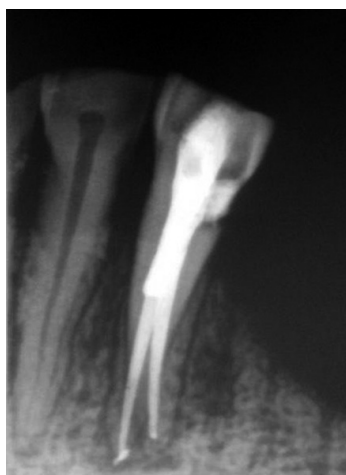
Figure-3: Post Obturation Radiograph 33

it is important to treat every tooth uniquely or else it will lead to failure of endodontic therapy.