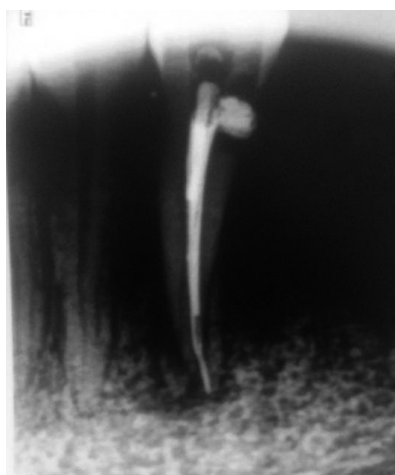
Figure-1: Preoperative radiograph 33