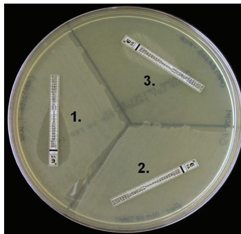
Figure-1: E Test for VRE detection

By increasing awareness regarding drug resistance and use of