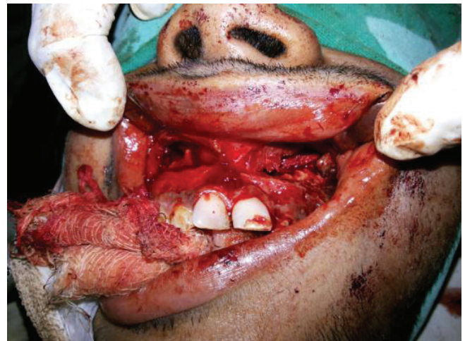
Figure-4: Bilateral Caldwell Luc operation performed

lowed by primary closure is recommended. 9 Since its introduction, the Caldwell-Luc procedure has become a standard approach for the management of conditions where the wide anterior opening provided by this procedure might prove to be beneficial, such as antral diseases as well as an operative route to reach such sites as the pterygomaxillary space, orbit, ethmoid labyrinth and medial skull base. However the advancements in the field of antibiotic therapy and endoscopic sinus surgery have limited the indications for this operation.