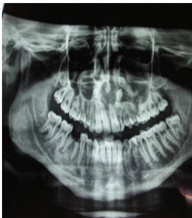
Figure-2: Panoramic radiograph shows bilateral well-defined radiolucencies, Left side cyst wall with fluid along with two unerupted teeth inside the cyst & Right side fluid containing cyst along with unerupted tooth.

sion which contained two teeth on Left side while on Right side a small cystic lesion along with tooth was present. CT scan of patient showed expansile cystic lesion pushing the floor and lateral wall of nose, eroding floor of maxillary sinus bilaterally; involving maxillary sinus lumen and reaching upto floor of orbit on Left side.