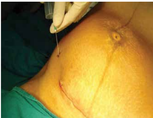
Figure-3: Puncture site showing ilioinguinal/iliohypogastric nerve block in post caesarean patient

feeding was “excellent” in all 30 (100%). Similarly, out of 30 patients in group B; comfort during first breast feeding was “excellent” in all 30 (100%). None of the patients in both the groups experienced “poor” comfort level during first breast feeding.