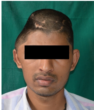
Fig-1: Preoperative frontal view

implants were then placed by the department of neurosurgery under general anaesthesia after raising the flap of the scalp. The implants were stabilised with the help of non-absorbable suture material (Fig5). Follow up was done at 72 hours, 1 week, 3 months and yearly basis.