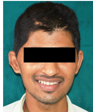
Fig-6: Post-operative frontal view