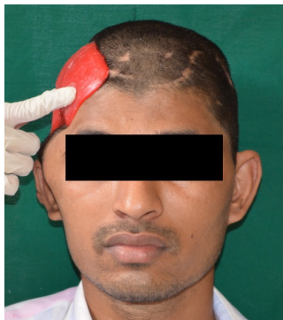
Fig-3: Trial of wax pattern