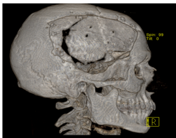
Fig-4: Post-operative CT scan with radiographic markers