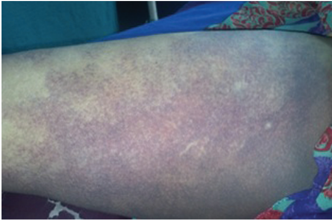
Figure-1: A large ecchymosis was seen on antero-medial side of right thigh