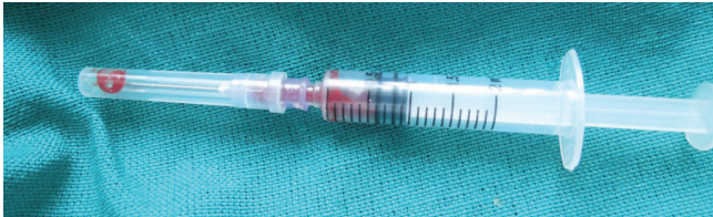
Figure-1C: FNAC with aspiration of frank blood

intra-oral film placed against the left buccal mucosa against the vascular lesion and exposed to x-rays. This resultant radiograph revealed multiple calcified areas with concentric pattern of calcification suggestive and confirmative of phleboliths [Fig-2B]. A final diagnosis of vascular malformation with phleboliths was considered.