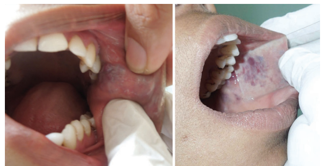
Figure-1A: Showing an intra-oral bluish colored lesion with racemose surface involving left buccal mucosa; Figure-1B: Showing positive Diascopy.

A 24 year old female patient reported to the department with a chief complaint of painless swelling in her left inner cheek region since 20 yrs. Swelling gradually developed over a period of time and was not associated with any other significant changes. On extra-oral examination revealed a diffuse swelling in the left lower third of the face measuring approx. 3x3 cms, roughly spherical in shape and was soft in consistency, non-tender with no secondary changes. Intra-oral examination revealed a solitary bluish colored swelling in the left buccal mucosa [Fig-1A] extending anteriorly from the left retro-commisural area till the retromolar area measuring approximately 3x4 cms with racemose surface and on palpation revealed soft in consistency, non-tender and with no pulsations. Posterior regions of the lesion revealed multiple hard calcified areas. Diascopy test was positive [Fig-1B]. FNAC revealed frank blood [Fig-1C], which was bright red in color. Clinically the lesion was considered to be a vascular malformation associated with phleboliths. Panoramic radiograph revealed multiple calcified areas in the left mandibular ramus region, which were considered to be superimposition of soft tissue calcifications associated with the lesion [phleboliths] [Fig-2A]. To confirm this, an intra-oral periapical radiograph was taken with the