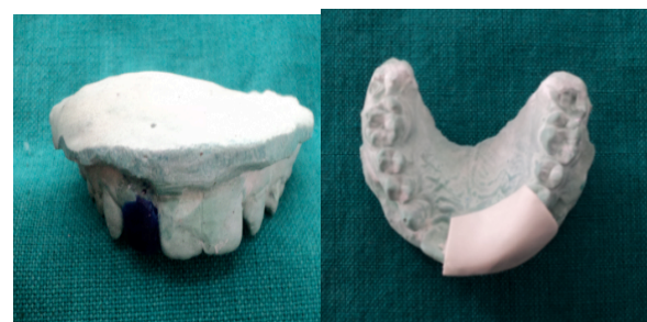
Figure-4: Mock up done using inlay wax and fabrication of silicone putty stent