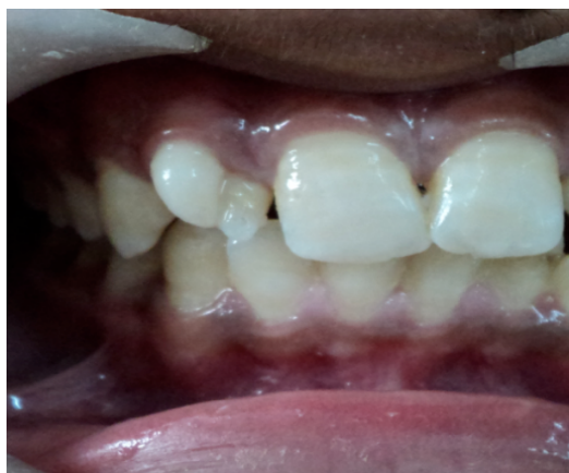
Figure-1: Intraoral view showing gemination of right maxillary lateral incisor

Treatment plan for the patient included esthetic rehabilitation. The Upper and lower impressions were made in alginate and the models were prepared using dental stone. The Buccal bulge on the conical tooth was scraped off on the model and a laboratory wax up was done using inlay wax to mimic the final esthetic look. A composite build up guide was fabricated using additional type silicone elastomeric impression material (Fig 4) (attinis putty supersoft, polyvinylsiloxane, coltene/ Whatedent/ AG /Altstatten, Switzerland) to register the palatal surface, proximal contours and the incisal edges of right lateral incisor against which the composite resin would be build.(Fig 4). Using this silicone putty guide the Buccal bulge of right maxillary lateral incisor was then clinically trimmed. The teeth were etched for 15 seconds with 37% phosphoric acid (scotchbond, 3MESPE, St.paul, minn) then photopolymerised for 20 seconds. The silicone putty guide was then placed in the oral cavity and then the right maxillary lateral incisor was build using composite resin (3M ESPE, St.Paul, Minn) in increments that were photopolymerised. Final finishing and polishing was done using a composite finishing kit and sofex discs (3M ESPE, St. Paul, Minn) (Fig 5). A follow up was done with the patient after one month and the clinically acceptable results were obtained.