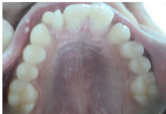
Figure-2: Intra oral view showing maxillary occlusal view