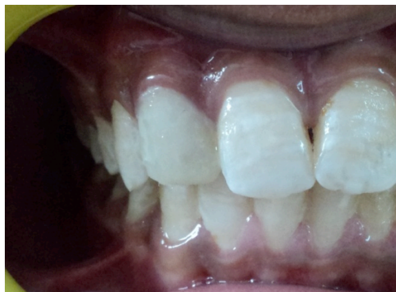
Figure-5: Intraoral view showing after esthetic build up