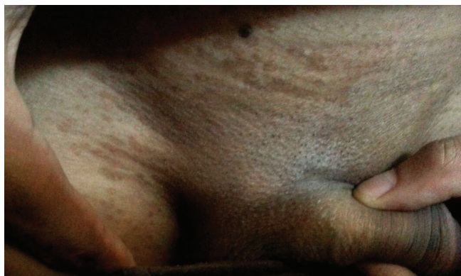
Figure-1: Hyperpigmented lesions over the skin of pubic region