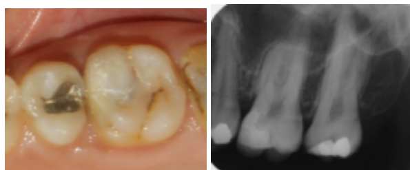
Figure-10: Postoperative intraoral and radiographic view

X duo, Dentsply). Finishing and polishing of the restoration was carried out subsequently (Fig 10). The patient is currently under regular follow up protocol.