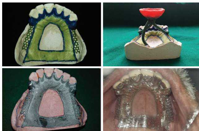
Figure-3: Wax-Up for Cpd Framework, Spruing, Casting and Try In Procedure

denture allowing all the forces to distribute evenly among all the teeth with milled surface. 7