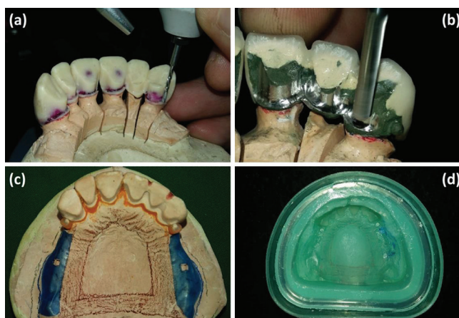
Figure-2: (a)Wax Milling, (b) Metal Milling, (c) Cast Ready for Duplication, (d) Mould to obtain Refractory Cast.