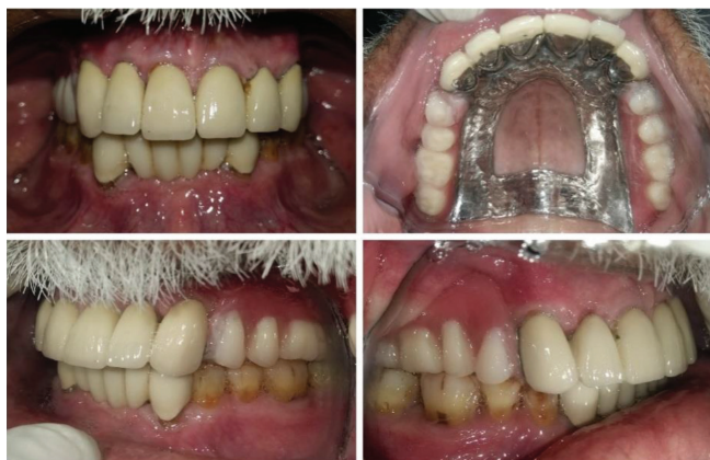
Figure-4: Denture Insertion.

In present case semi precision non rigid attachments were preferred (Rhein 83- OT Strategy) for fixation between fixed and removable partial dentures as it fulfills most of the criteria suggested for attachment selection. However precision attachments are not without disadvantages. Most of the attachments are very small and come with many parts to assemble. Construction of such attachment require skill. The parts of the attachment are sometimes exposed to wear and tear and needed to be replaced over time. 8