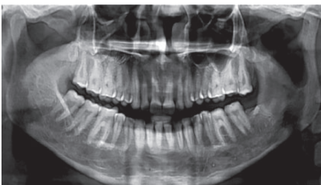
Figure-4: 6 month post op.

a recurrence rate of about zero, is not significantly better at eliminating recurrences than enucleation plus Carnoy's solution or marsupialization plus cystectomy. Therefore, to minimize invasiveness and recurrence, the