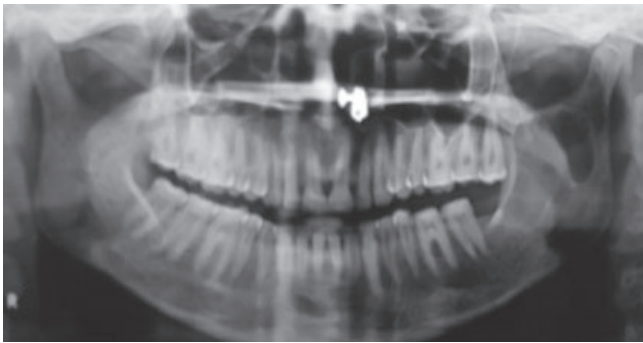
Figure-1: pre operative