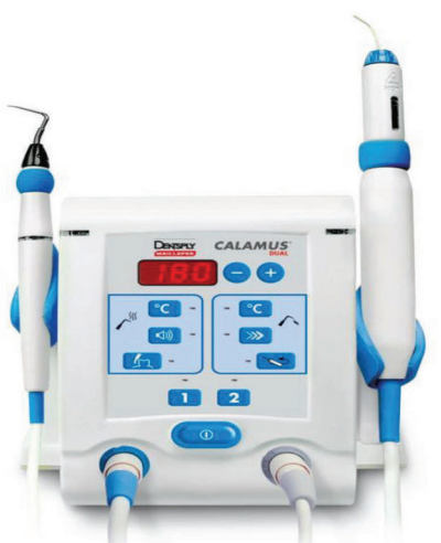
Figure-3: Calamus dual 3d obturation system 2