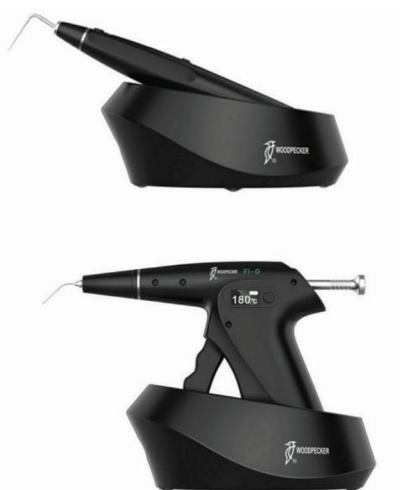
Figure-2: Woodpecker Obturation Pen System