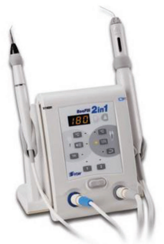
Figure-4: BeeFill system 9

Recently, a new thermoplasticized injection device, the BeeFill system, was introduced to simplify obturation after canal preparation. BeeFill 2 in 1 is a recently introduced warm vertical obturation system that includes downpacking and backfilling equipment in one unit. It is a high temperature gutta-percha injection unit with 2 pluggers; the gutta-percha cannula is set in a handpiece with a 360° operation angle. Heated pluggers are used to thermoplasticize and downpack the gutta-percha at the apical third. The remaining part of the root canal is then backfilled using Obtura 2, which delivers thermoplasticized gutta-percha that is compacted vertically