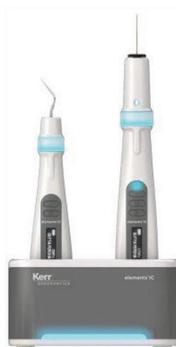
Figure-5: Elements™ IC Fill/Obturation

by pluggers. According to the manufacturer, canal obturation by the BeeFill system results in reliable obturation of lateral canals, minimal risk of root fracture, gutta-percha filling to the desired level for immediate placement of a fiber post, and adhesive restoration in 1 appointment. 9