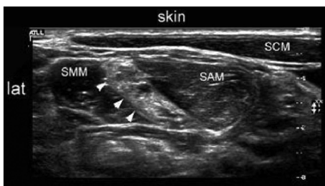
Figure-1: Transverse sonogram showing local anaesthetic spread and distension in the interscalene groove; SCM - sternocleidomastoid, SMM - scalenus Medius muscle, SAM - scalenus anterior muscle

Duration of motor block in group A was 915.7 ±189.92 and in group B was 474.6 ±20.63. The difference in duration of motor block in two groups was statistically significant. (table-2, graph-2)