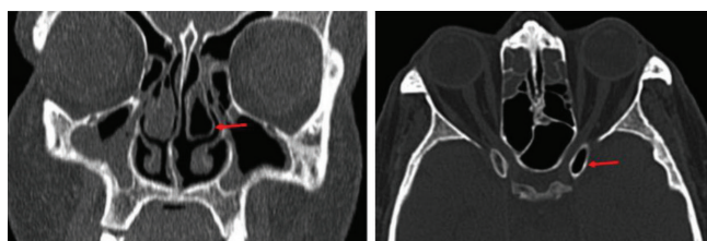
Figure-5: Showing concha bullosa on left side; Figure-6: Showing Onodi cells on left side