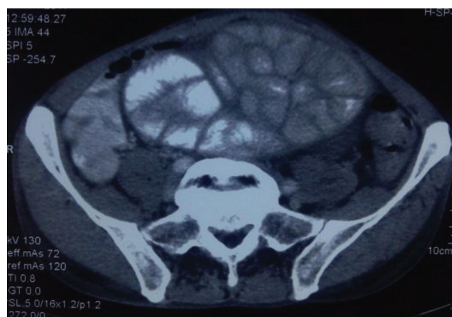
Figure-1: CT showing encapsulating fibrous membrane surrounding intestinal loops

Radiological features are also non specific. CT is of more specific