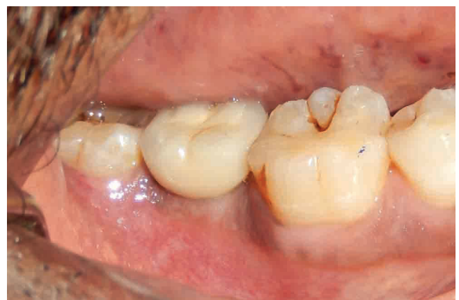
Figure-3: Final prosthesis in place over the implant - buccal view