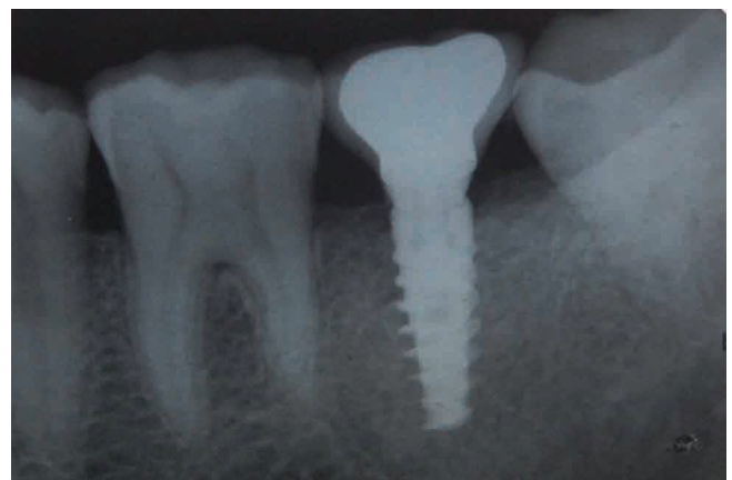
Figure-4: Follow-up IOPA of the implant with prosthesis