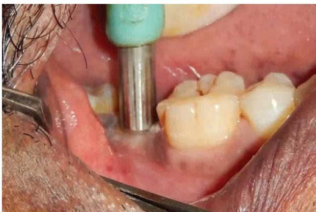
Figure-2: Tissue punch to guide implant osteotomy